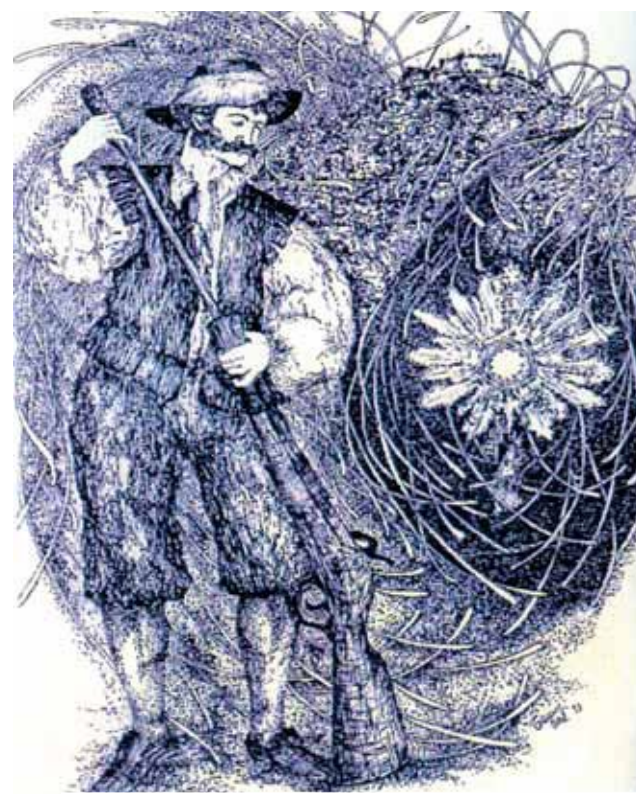
An antique print (ca. 18th Century) depicting the miracle