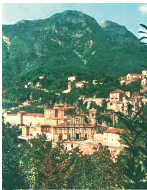
Panoramic view of Cava dei Tirreni