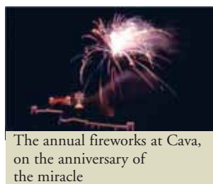
The annual fireworks at Cava, on the anniversary of the miracle