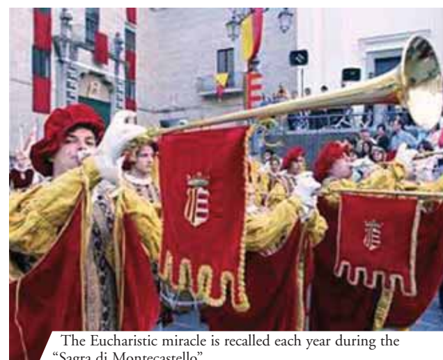
The Eucharistic miracle is recalled each year during the “Sagra di Montecastello”