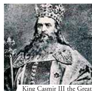
King Casimir III the Great