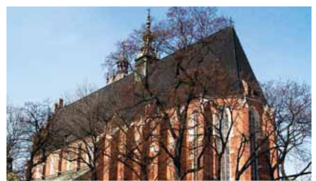
The Corpus Christi Church, Krakow

In the year 1345, King Casimir III the Great of Poland gave orders to build a church named Corpus Christi in honor of the Eucharistic miracle that was verified that same year. It had taken place in the village of Wawel, near Krakow. Some thieves broke into a little church (The Collegiate Church of All Saints), which was a short distance from Krakow. They forced their way into the tabernacle and stole the monstrance, which contained consecrated Hosts.