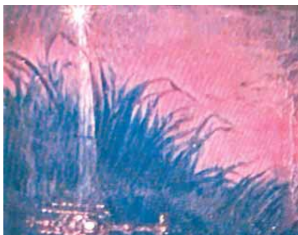
Detail of the painting