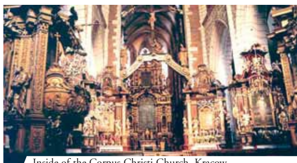
Inside of the Corpus Christi Church, Krakow