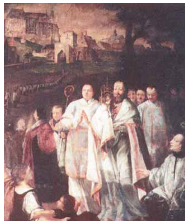
A representation of the procession of the bishop back into the city after finding the Hosts of the miracle in the marsh

spot where the treasure had been abandoned. Bright flashes of light were visible for several kilometers. Frightened villagers approached the area and reported back to the Bishop of Krakow. The bishop called for three days of fasting and prayer. On the third day, he led a procession out to the marsh. There, they found the monstrance, and within it they found the Hosts, which were unbroken and were the source of the unusual lights. The people began to pray and to celebrate the miracle. Annually on the occasion of the feast of the Corpus Christi, the miracle is celebrated in the church of the Corpus Christi in Krakow.