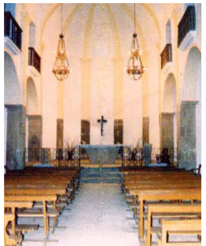
Inside the sanctuary