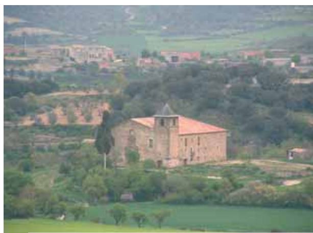
Sanctuary where the miracle occurred