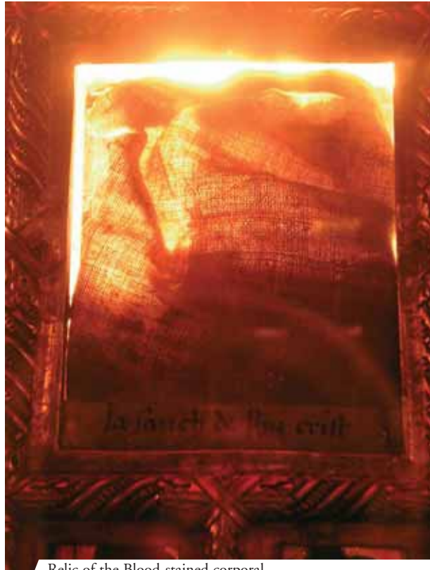
Relic of the Blood-stained corporal

The wine in the chalice was converted into Blood and it was poured on the altar cloth flowing until it hit the ground.