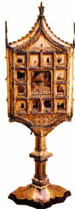
Monstrance containing the relics of the miracle