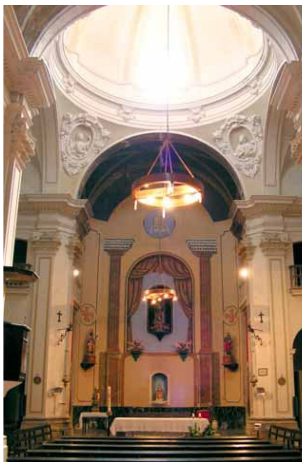
Inside the Church of San Cugat