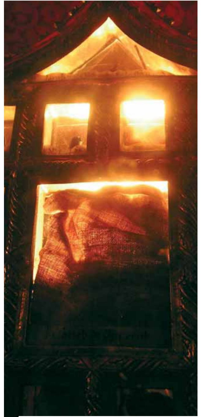
Detail of the monstrance containing the holy relics