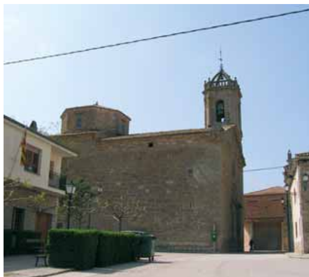
Church of San Cugat, where the relics of the miracle are kept