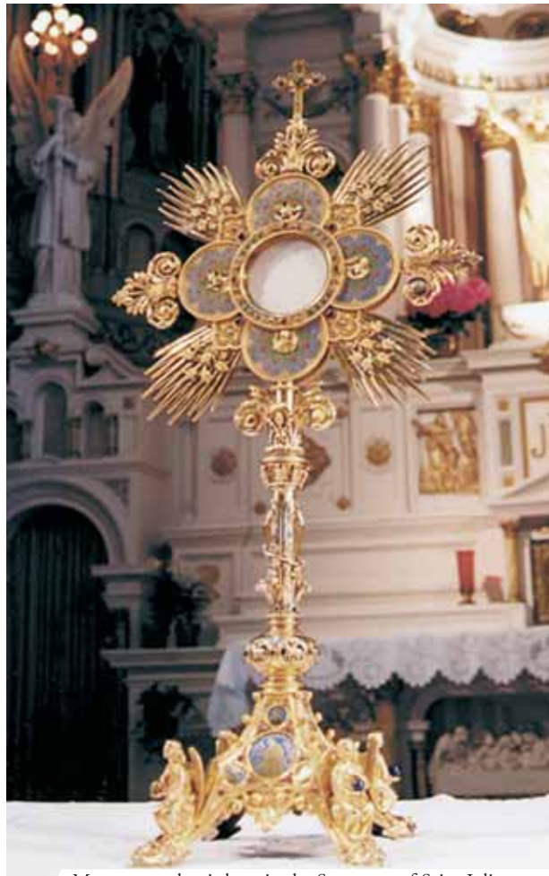
Monstrance that is kept in the Sanctuary of Saint Juliana, Liège

“Even though the Eucharist is solemnly celebrated every day of the year, on one day we pay special honor to the Body of Christ. We may, of course, invoke the Lord with our minds and our spirits at any time, but we do not in this way obtain the Real Presence of Christ. With the Eucharistic commemoration, however, Jesus Christ is actually present with us in his own substance. As the risen Christ told us prior to his Ascension: ‘And behold, I am with you always, until the end of the age.’ (Mt.28, 20) ...He would remain and be with them even by His bodily presence.” Pope Urban IV: TRANSITURUS DE HOC MUNDO