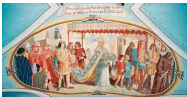
Fresco depicting the procession held in Rome in 1513, in which Pope Leo X is carrying the precious relic through the city streets