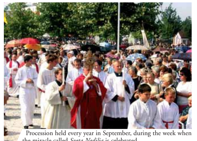
Procession held every year in September, during the week when the miracle called Sveta Nedilja is celebrated