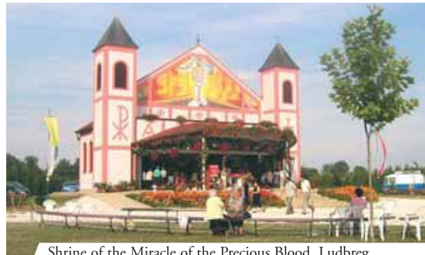
Shrine of the Miracle of the Precious Blood, Ludbreg

The relic of the Blood has remained perfectly intact and is kept in a precious monstrance made at the request of Countess Eleonora Batthyany-Strattman in 1721.