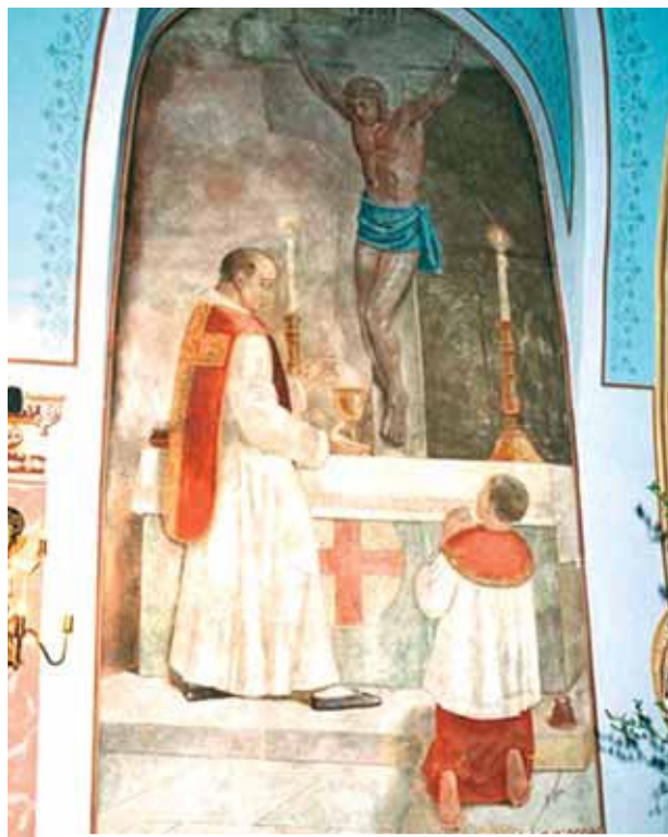
Fresco depicting the scene of the miracle

During Mass at Ludbreg in 1411, a priest doubted whether the Body and Blood of Christ were really present in the Eucharistic species. Immediately after being consecrated, the wine turned into Blood. Today the precious relic of the miraculous Blood still draws thousands of the faithful, and every year at the beginning of September the so-called “Sveta Nedilja - Holy Sunday” is celebrated for an entire week in honor of the Eucharistic miracle that occurred in 1411.