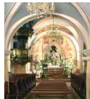
Interior of the chapel of the Batthyany family castle

In 1411 at Ludbreg, in the chapel of the Count Batthyany's castle, a priest was celebrating Mass. During the consecration of the wine, the priest doubted the truth of transubstantiation and so the wine in the chalice turned into Blood. Not knowing what to do, the priest embedded this relic in the wall behind the main altar. The workman who did the job was sworn to silence. The priest also kept it secret and revealed it only at the time of his death. After the priest's revelation, news quickly spread and people started coming on pilgrimage to Ludbreg. The Holy See later had the relic of the miracle brought to Rome, where it remained for several years. The people of Ludbreg and the surrounding area, however, continued to make pilgrimages to the castle chapel. In the early 1500s, during the pontificate of Pope Julius II, a commission was