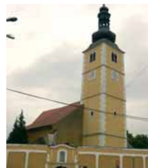
The chapel of the Batthyany family castle where the miracle occurred