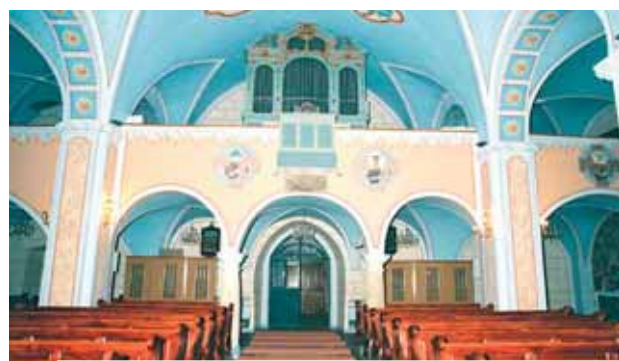
Interior of the shrine