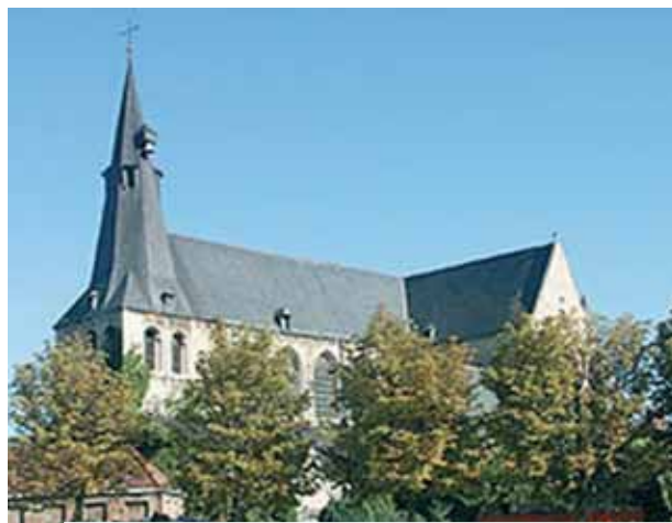
Church of St. James in Louvain