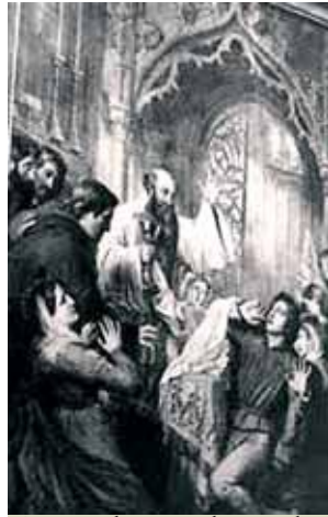
Painting depicting the miracle, Church of St. James, Louvain