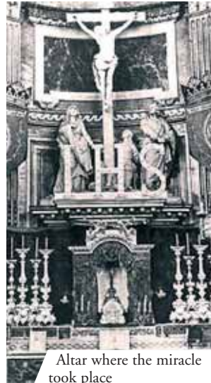
Altar where the miracle took place