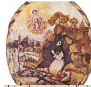
Inés in the cave where she lived as a hermit