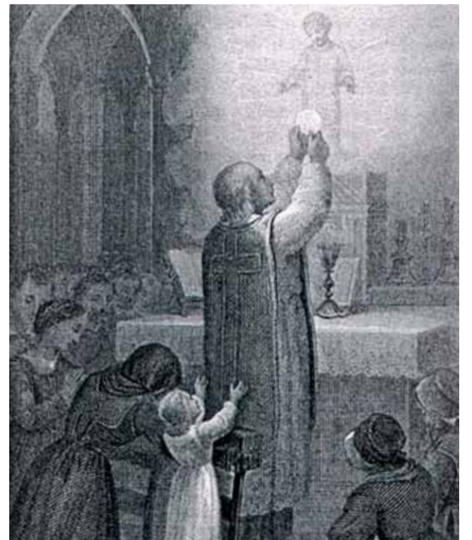
Ancient print of the miracle