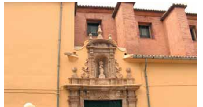
The church where the miracle took place