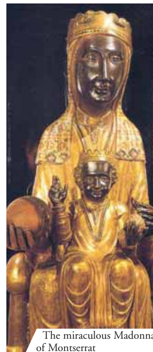
The miraculous Madonna of Montserrat