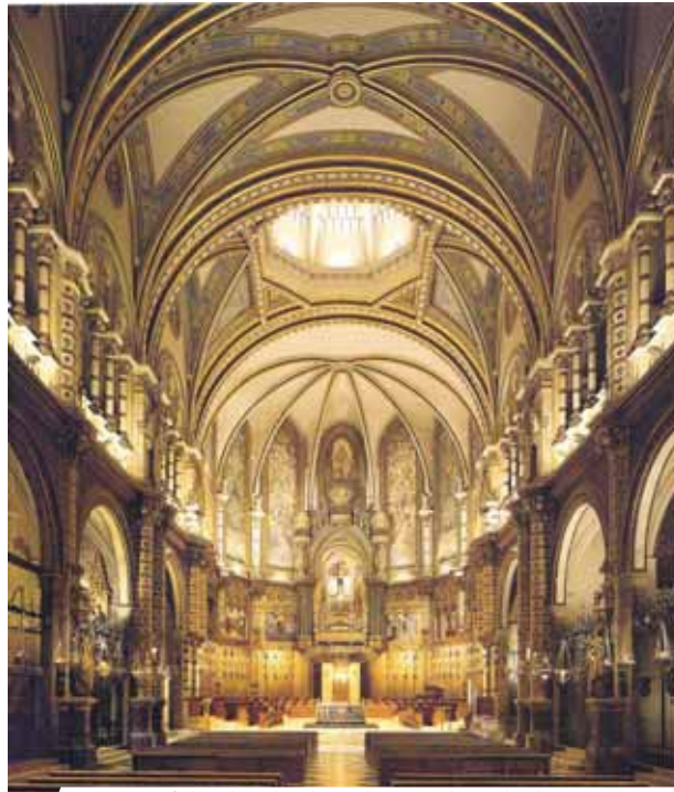
Interior of the church where the miracle took place