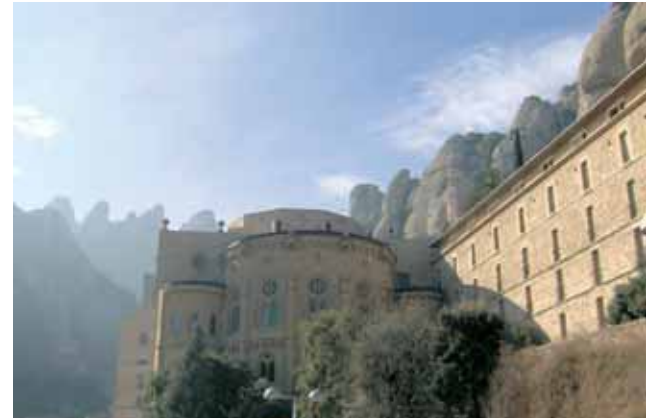
Sanctuary of the Madonna of Montserrat