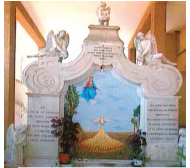
A plaque at the place where the Hosts were found