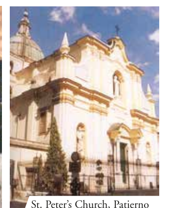
St. Peter's Church, Patierno