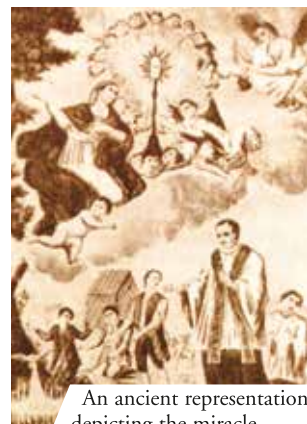
An ancient representation depicting the miracle