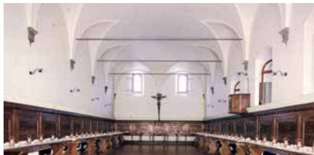
Refectory of the Abbey