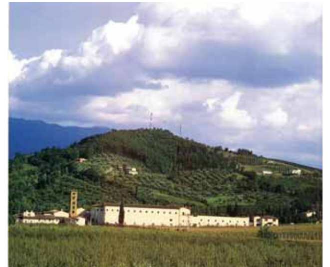
According to a 17th century inscription on the façade of the church, the Abbey of S. Maria of Rosano, was founded in 780