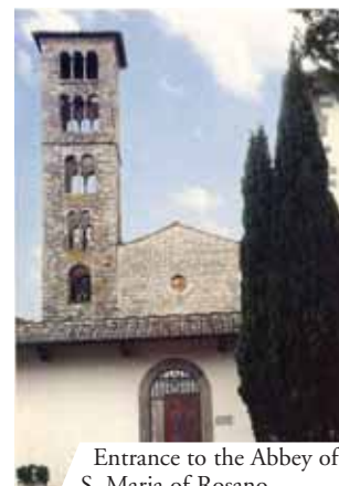
Entrance to the Abbey of S. Maria of Rosano