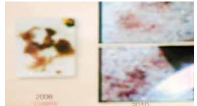
In 2010, by means of a study of digital microscopic penetration through the shooting of ultraviolet rays and intense white light it was demonstrated that the tissue seen in the upper part of the Host showed some dry coagulated blood. The analyses showed moreover that under the Blood already coagulated beyond some structures of the white Host, there was also the presence of fresh Blood. Also this analysis confirmed the fact that the blood was not placed by someone from the exterior because if it were like this it could not remain fresh for so much time (from 2006 to 2010) only in the internal part of the Host.