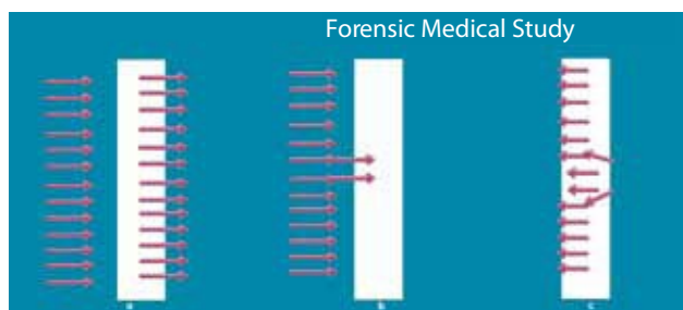
Within the graphic, in the drawing c it is seen clearly how the flow of blood occurred, from the interior towards the exterior. In the drawing a it is seen how it would have been if someone had inserted some blood from the exterior. It would have expanded into all the channels. There is no situation b in which someone could put some liquid which entered only through two channels and the rest remaining on the surface without being absorbed.