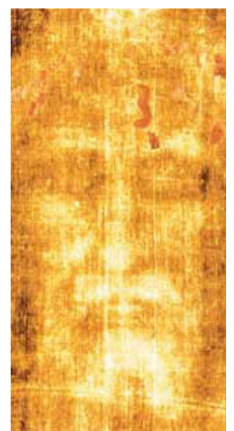
The Gene Ex genetics laboratory in Bolivia performed another study and confirmed that it was human blood of the type AB just like the one found in the cloth of the Shroud of Turin and of the Eucharistic Miracle that occurred in Lanciano in 700 AD.