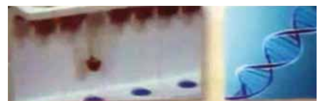
When there is the presence of human DNA one thinks that also the genetic profile can be automatically obtained. Interestingly in all the studies performed on the images that sweated blood or in the consecrated Hosts that have bled the presence of DNA was found, but when the work of sequencing to extract the genetic profile was done, they were never able to obtain it. The theologians say that since Jesus does not have a father, his father is the Holy Spirit, it is not possible to obtain his genetic profile.

7. The immunohistochemical studies reveal that the tissue found corresponds to the muscle of the heart