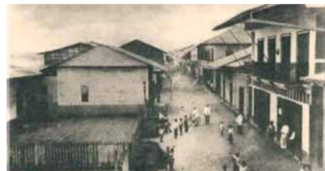
Tumaco at the time of the 1906 miracle