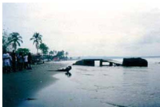
Beach at Tumaco