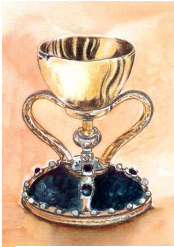
The Holy Chalice of Valencia

This precious object has always been at the center of fantastic stories and novels like the legend of the Knights of the Round Table in England, the stories of Perceval in France and Parzival in Germany of the Twelfth - Thirteenth century. This genre was used by Wagner in a Christian-esoteric perspective and at the end of the twentieth century the fantastic novels of B. Cornwell favored the birth of the editorial trend still alive today.