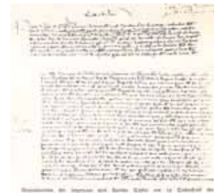
Document regarding the reception of the Holy Chalice in the Cathedral of Valencia in 1437