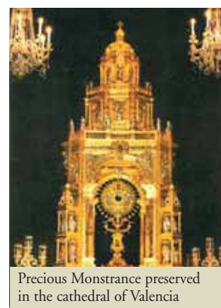
Precious Monstrance preserved in the cathedral of Valencia