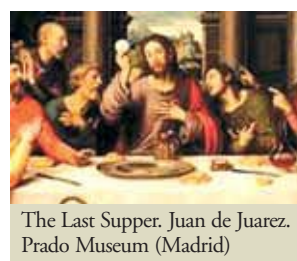
The Last Supper. Juan de Juarez. Prado Museum (Madrid)