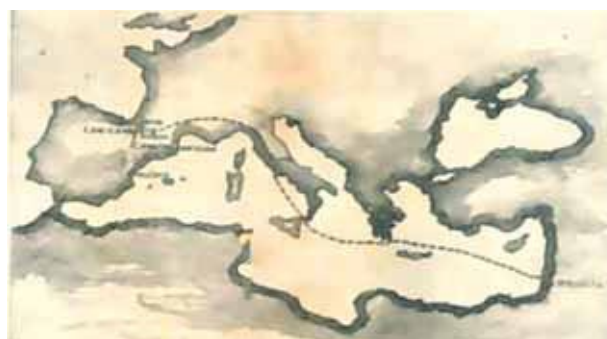
Route traveled by the Holy Chalice