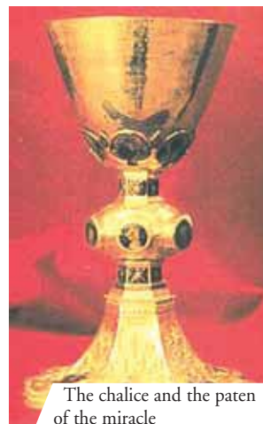
The chalice and the paten of the miracle