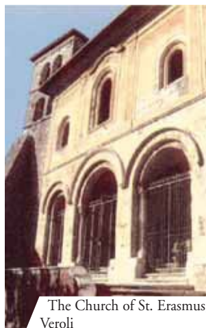
The Church of St. Erasmus, Veroli