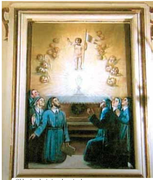
Old print depicting the miracle

During Easter of 1570, in the Church of St. Erasmus in Veroli, the Blessed Sacrament was exposed (at the time, the Blessed Sacrament was first placed in a round pyx and then placed in a large chalice, covered with a paten) for the 40 hours of public adoration. The child Jesus appeared in the exposed Host and manifested many graces. Today, the chalice where the Blessed Sacrament was exposed is kept in the same church of St. Erasmus and is used once a year at the celebration of Mass on Easter Tuesday.