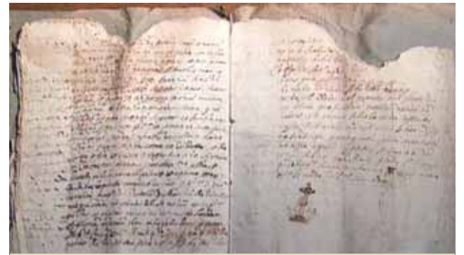
The document which records the sworn and written testimony of those witnesses who were present at the apparition