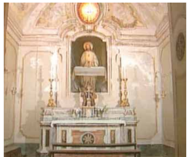
The chapel where the apparition occurred

At Easter in 1570, in the Church of St. Erasmus, the consecrated Host, according to the traditional rite at the time, was placed in a round silver container (pyx) and placed in a burse like holder – this was later placed in a large ceremonial silver chalice with its paten; the whole wrapped in an elegant silk cloth.