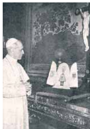
Pope Pio XII praying before the statue of the Virgin of Pilar that he received as a gift