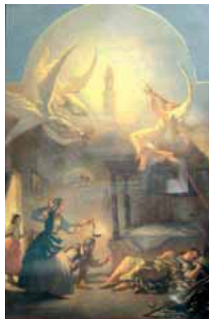
Ancient painting depicting the miracle in the Sanctuary of Pilar