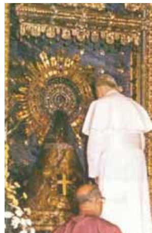
John Paul II pausing in front of the statue of the Virgin of Pilar, Zaragoza