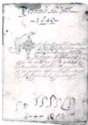
Original document notarized by Miguel Andreu on April 2, 1640 certifying the miracle of Calanda