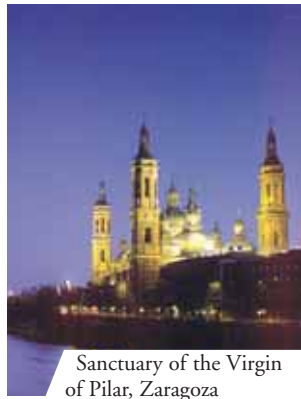
Sanctuary of the Virgin of Pilar, Zaragoza