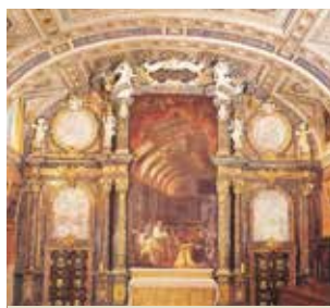
The altar where the painting recounting the Sagrada Forma is kept