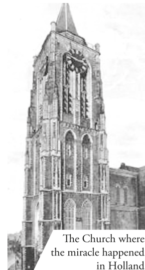
The Church where the miracle happened in Holland