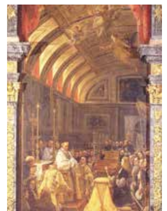
Painting by Claudio Coello commissioned by Carlos II