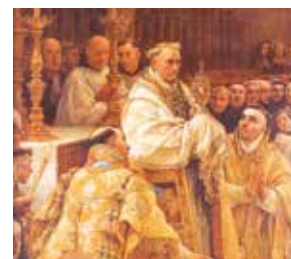
Detail of the painting by Claudio Coello