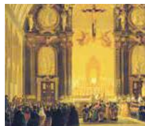
Procession in Honor of the Miracle - Dignitaries of Court in Adoration before the Sagrada Forma