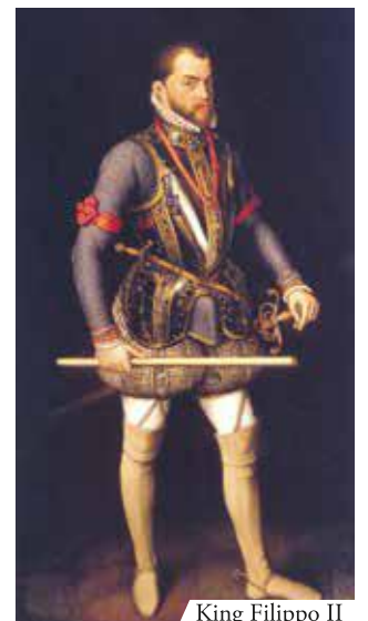
King Filippo II