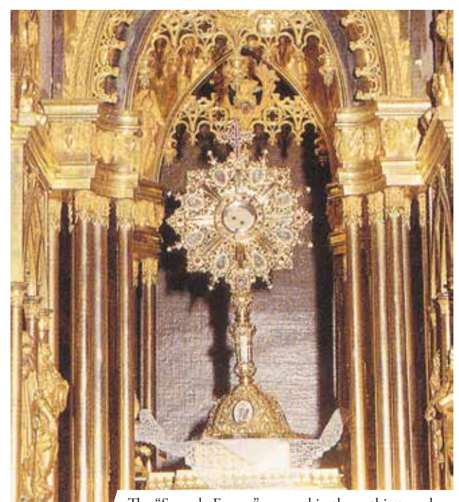
The "Sagrada Forma" exposed in the gothic temple