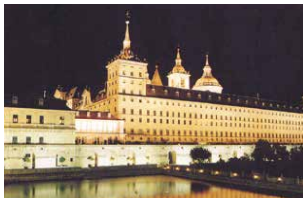
View of the Royal Monastery of the Escorial