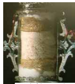
Detail of the corporal