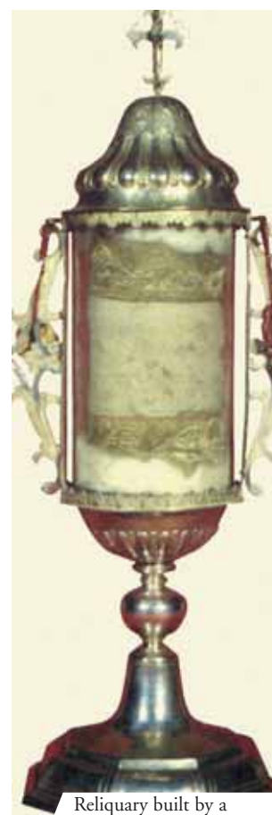
Reliquary built by a Venetian craftsman in 1755