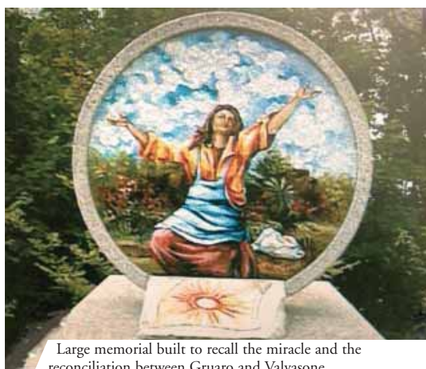
Large memorial built to recall the miracle and the reconciliation between Gruaro and Valvasone