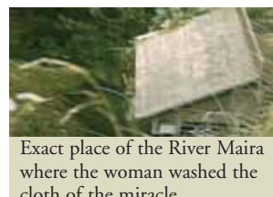
Exact place of the River Maira where the woman washed the cloth of the miracle