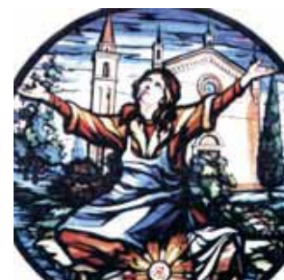
Church of Gruaro. Rose window depicting the miracle