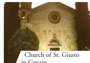
Church of St. Giusto in Gruaro