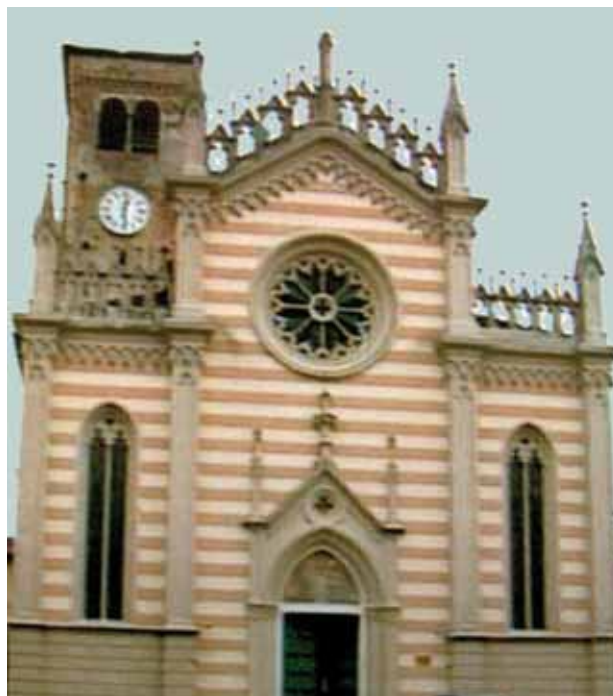
The blood-stained linen cloth is kept in the Church of the Most Holy Body of Christ in Valvasone