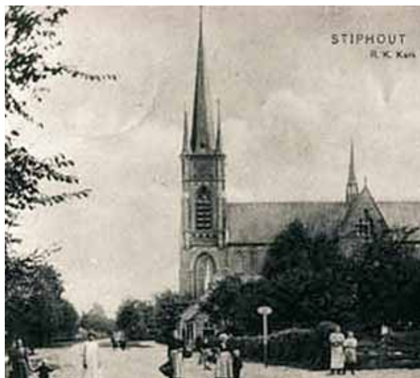
Saint Trudo's Church, Stiphout