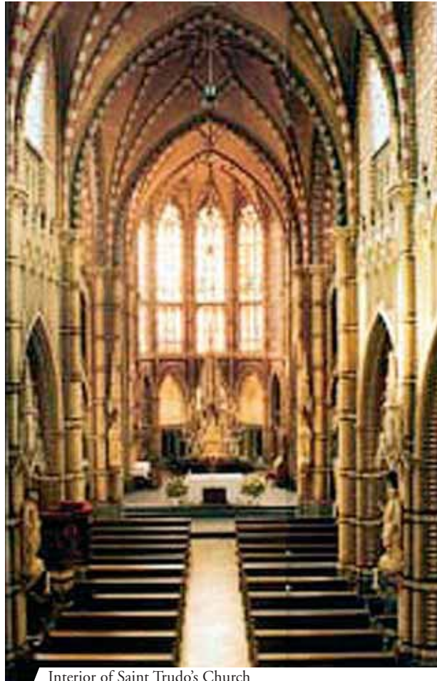
Interior of Saint Trudo's Church

This event is venerated each year by the residents of Stiphout especially on the feast of Corpus Christi.